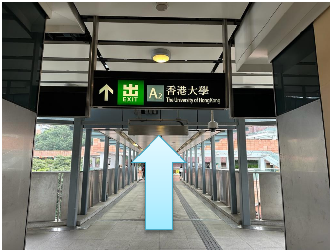
3. Arrive HKU, walk along the bridge and Upper University Street on the left towards Run Run Shaw Building