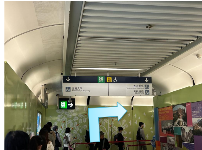
2. Take the escalator to EXIT A2