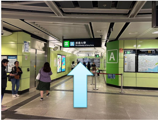
1. Walk along the MTR HKU Station EXIT A